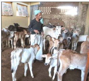
Calves waiting to be fed at the shelter.

Since we often visit animal shelters when travelling, when we planned to visit India, we asked about visiting a dog or cat shelter. We were informed that, while there are dog shelters in the country, there are not very many, but we were certainly welcome to visit a cow shelter. We accepted the offer and found similarities between CASA and the cow shelter. The cows are loved and cared for and they rely on the volunteers and community for support.