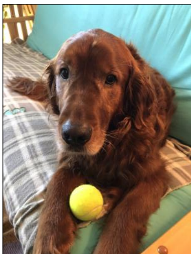
Exercise and love have calmed Raider (now Radar)

Note: From Taz's shelter behavior, the staff was worried that he would be a barn cat. It turned out that Taz is "the barn cat who is not a barn cat!"