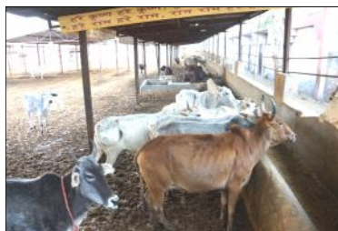
Cows came walking over as we approached.

For Hindus in India, cows have a religious significance and to protect abandoned cows there are numerous cow shelters throughout the country. These shelters, called Goshala, focus on housing and treating cows. Goshala, is a Sanskrit word ("Go" means cow and "Shala" means a shelter, the abode or sanctuary for cows, calves and oxen). In many cases non-lactating cows are abandoned and such cattle roam around streets and cause accidents. People are urged to surrender their cows to these shelters at no charge.