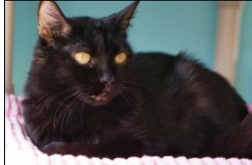
Pansy's fur is slowly Improving.

(Continued from Page 1, Black Cats Waiting for You)