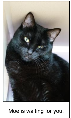
Moe is waiting for you.

Meanwhile, vocal JJ has just moved from isolation to the purple cat room. When he was surrendered he had fleas, a skin condition and was missing most of his fur. While in isolation, he greeted the staff daily with loud meows. He is a sweet cat and gets along with other cats.