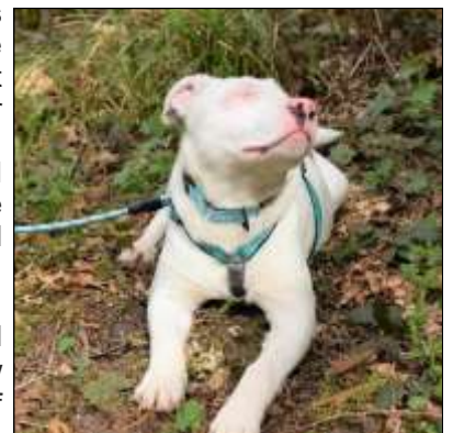
Lucky is a happy girl who loves to be outdoors.

Lucky is a young American Bulldog mix about four months old. She was brought to the shelter as a stray and no one came to reclaim her. When she arrived at the shelter, it was clear that her eyes were not properly formed, as if her eyeball stopped developing before it really ever started. Lucky is also deaf so it is likely that her mother either had an infection while her puppies were developing or there was some other fetal issue. Once at the shelter she had surgery to remove her eyes (enucleation surgery).