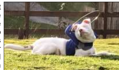
Lucky has a special halo to help her navigate outside.

"Can she be house trained?" Yes! House training isn't much much different than with a typical puppy. Crate training and frequent potty breaks have been key. The addition of a scent (vanilla) was placed by the door to outside to help her find the door to go out. She was initially walked on a leash in the yard to make sure her still healing eye area was protected and until the yard became familiar. When in her crate, she will bark when she needs to potty. Using a similar method (scent) she should be able to use a dog door into a securely fenced yard.