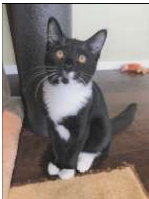
David is a cuddle buddy.

Alexis and David have been such a fun burst of new energy added to the household. I adopted them after losing my 19.5 year old cat. Kiora (also a CASA alumni) and I were missing our buddy. Alexis and David are still learning to give Kiora her space. They are fascinated (or maybe obsessed) by her, but she is working on teaching them manners and proper social distancing.