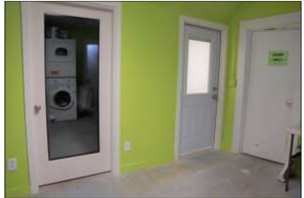
Another door in the Laundry Room leads to the shelter manager's new office

Meanwhile, more work is needed in the "new area" to provide supply storage and a small staff/volunteer break area. It is a logistical challenge (where to place cages, etc.) while the improvements are being made since our space is still very small. We are excited that, in the long run, these improvements will help not only the dogs and cats who call CASA home, but the staff and volunteers who care for them.