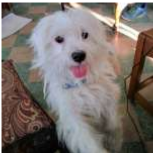
Dillon is truly loved.

As a volunteer I was privileged to meet Dillon when he arrived at CASA. Dillon, a 2 year old pup who had no human handling and had been housed in a crate with his 2 brothers. No playful puppy years for Dillon. His skin was red and scabbed with hair loss and he was underweight. I had to wrap him in a towel to get to the car. He had never been outside to do his "business". His first act of wanting to belong was to put his front paws on my leg, lift a paw to get his chest rubbed