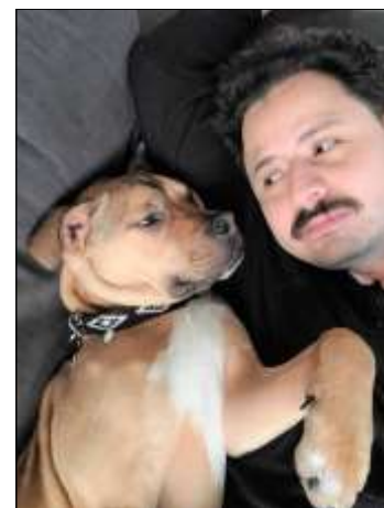
Binky loves everyone.