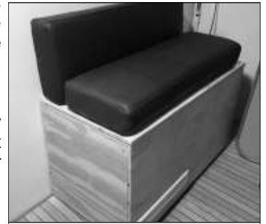
Isabelle's little room

www.microship.com/feline-outhouse/ Building a Feline Outhouse – Nomadic Research Labs