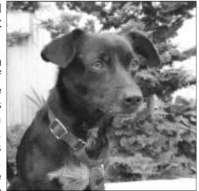
Anthony fears strangers

Anthony, a lively 2 year old Dachshund mix, had a very rough life at the hands of a cruel person and is extremely fearful of strangers. He is staying in the Cat ISO/office area of the shelter so that he can interact with people. Although he is afraid of all strangers, he is particularly fearful of men/children and hides under the cat cages when they come into the room. With the people he has come to know and who maintain his trust, he is very affectionate, greets them with a wagging tail, bounces, and even some squeals of delight when they arrive in the morning. The joy is short-lived if there is a sudden noise or if his old fears surface. There has been a lot of progress, but he has a very long way to go. Anthony is still an "animal in need."