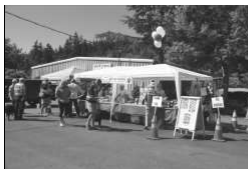
Fundraising and Outreach Events