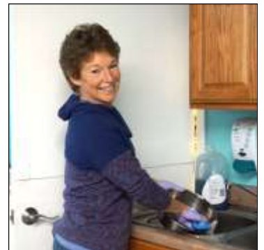
Inside the shelter

Questions? Send email to: casa@camanoanimalshelter.org