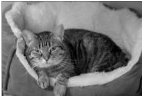
Princess tells her story

8 AM It's morning, I hear the jingling of keys and the door knob turning, then this annoying beeping starts, but not for long because once the human comes in she presses some buttons and the beeping stops. Oh Boy I am so excited. I jump down from my nice cozy bed up on the counter. YES!! She sees me and comes over and gives me a pet. Purrrrrrrr! I love that she greets me first..... What is she doing now?