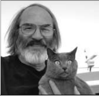
Isabelle, the boat cat

My dear Isabelle, whom I met at CASA in 2011 when she was named Grayberry, continues to be my best friend, and we live aboard a 50-foot boat in Friday Harbor. Thought you might like to see her facilities... a cat door under my desk opens into a little room with litter box, LED lighting, air cleaner with carbon filter, convective airflow, paw-cleaning mat, and a webcam so I can check status from any browser. This has completely solved the smell and tracking issues of her litterbox, and it doubles as a comfy seat on my afterdeck. Thanks again for introducing me to the most amazing cat ever.