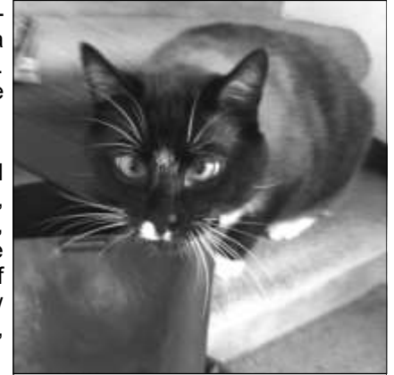
Fonse, the Siamese guard cat