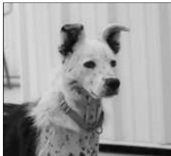
Tillie's coat is improving

Tillie and Rufus arrived with dry, scaly skin where mange had resulted in hair loss and skin infections. As part of their treatment, they are now given a high quality diet to boost the immune system, while also being treated for mange itself. Even after they have been scraped clear for mange, they will have to be on a specific monthly flea treatment that also covers demodex mange. They