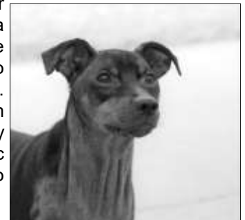
Rufus continues to battle mange