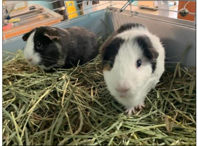
Huckleberry and Finn are waiting for just the right home.

Normally, Guinea Pigs are adopted quickly. In this case, however, potential adopters must have thorough knowledge of Guinea Pigs and access to an exotic animal veterinarian. As a bonded pair, Huckleberry and Finn must remain together because they rely on each other for companionship. Guinea Pigs with mites can develop seizures and this was the case with these boys. Unfortunately Huckleberry has residual seizure activity from his fight with mites. These seizures are very short. He is left unharmed, but this makes prior knowledge and experience essential.