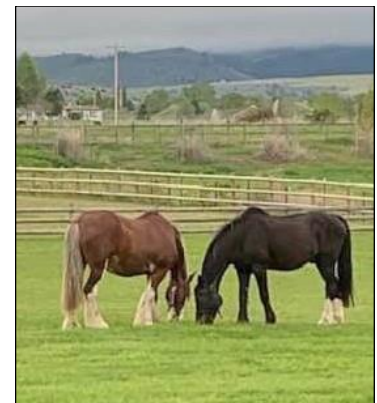
Rescue provides safe haven for draft horses.

“All Creatures Great and Small.” We’re all familiar with that phrase. When it comes to animal shelters, it’s really true – there are safe havens for every size animal. Recently I was able to tour the “1 Horse At A Time Draft Horse Rescue” in Corvallis, Montana. The Draft Horse Rescue is driven by a single goal: to save unwanted, neglected and abused draft horses from going to slaughter! The rescue wants to do its part in making the world a better place for all, even if it can only be done “1 Horse At A Time.” They seek out unwanted old, injured or sick draft horses being sold at auction that would otherwise be purchased and killed for meat.