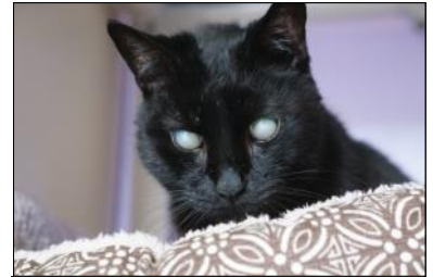
Houdini is enjoying his foster home.

Houdini was brought to the shelter as a stray in February when he appeared on someone's deck during the snow storm. Visits to the eye specialist show that he suffers from high blood pressure, is truly blind and his retinas are detached. Because of this he is not a candidate for surgery. Houdini is underweight, has kidney disease and ear infections. Although he managed at the shelter and was a favorite of visitors to the shelter, it became apparent that Houdini needed some time away from the shelter and was an ideal candidate as a foster.