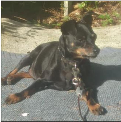
Murphy is enjoying his new family and loves to swim.