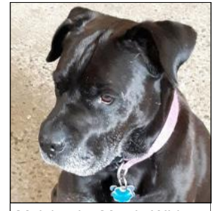
Maisie aka Mystic White Adopted 2008