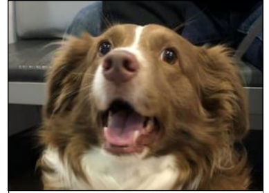
Athena's recovery is underway.

Thanks to generous donors and funds already at CASA, the surgery was scheduled. Surgery was performed at the Veterinary Specialty Center of Seattle in Lynnwood and Athena was taken to a foster home to recover. The surgery was successful and Athena improved steadily. In no time she had good range of motion and could put weight on the leg. She is now through the toughest part of her recovery and will continue to improve over time. She is a totally different dog than the one who walked into CASA originally. Athena had her big follow-up appointment where they x-rayed her one last time to make sure she was ready to move forward with her next phase of life. After she got the all-clear, her foster parents officially adopted her knowing they fell in love with her on day one. We wish Athena the best in her new life where we now know she will be happy and truly more comfortable.