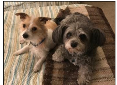
Noodle and his "brother", Smokey