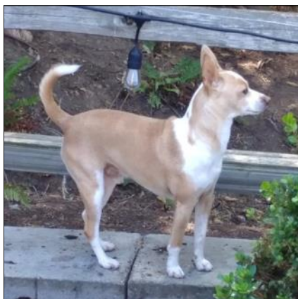
Nacho watching for wildlife