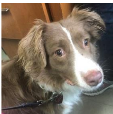
Athena had difficulty in Walking when she arrived.