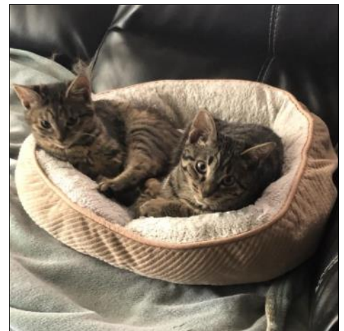
Tortellini and Bowtie are best buds and keep everyone entertained.